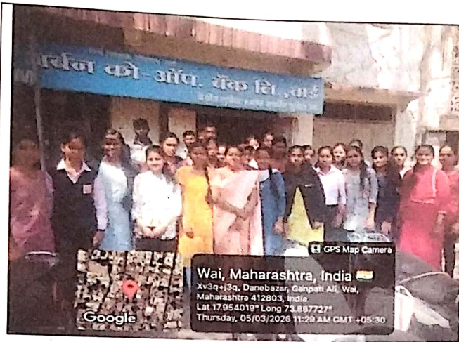
B.Com. Part-I students visited to Wai Urban Co-op. Bank Ltd., Wai.