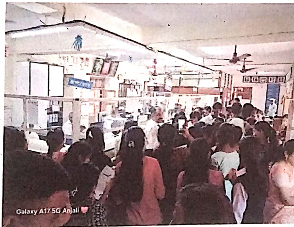
Senior Officer introduced various Departmental functions to the students.